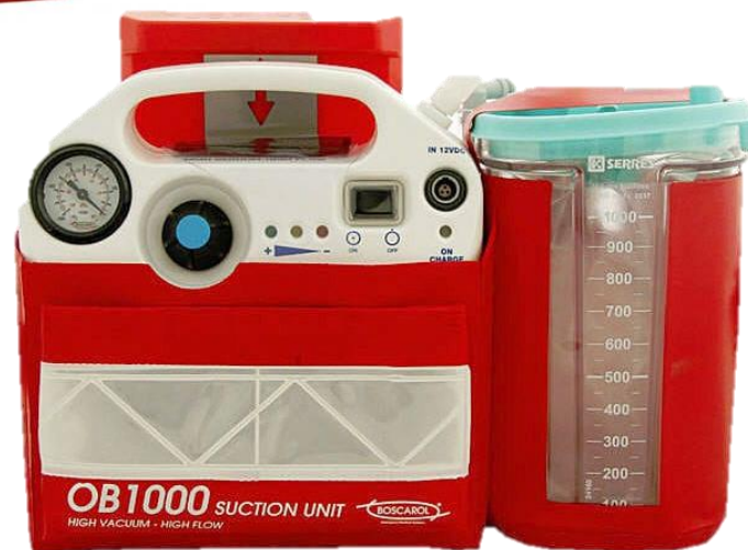
Suction Unit - Boscarol - OB1000