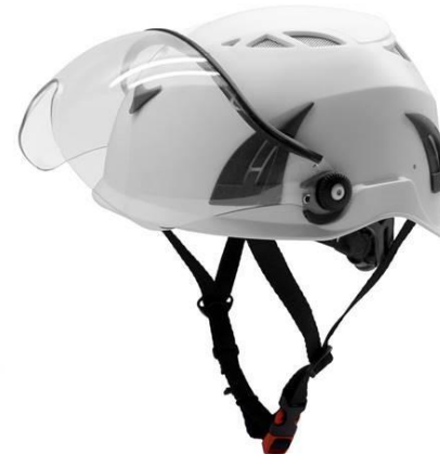
Helmet - Protective - Plastic with Visor