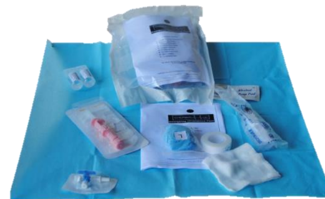
CritiPack® Intraosseous Access Pack