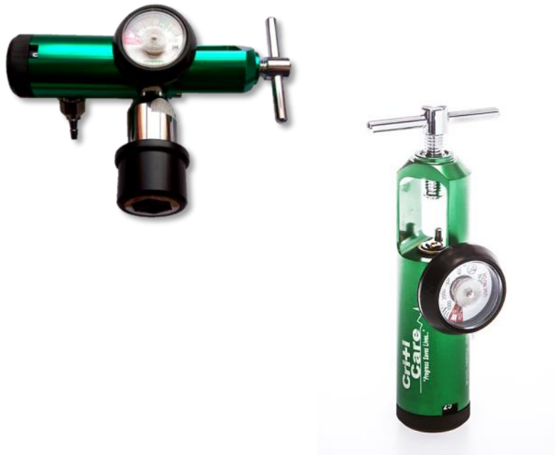
CritiCare ® Pin-Index Regulator