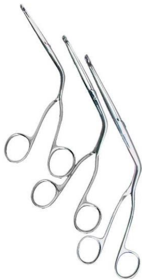
CertiCare® Magills Forceps