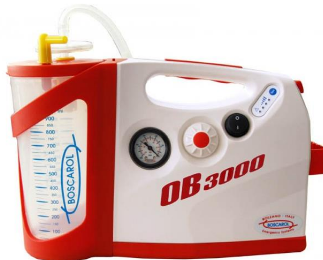
Suction Unit - Boscarol – OB3000