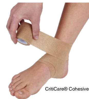
CritiCare® Cohesive Bandages