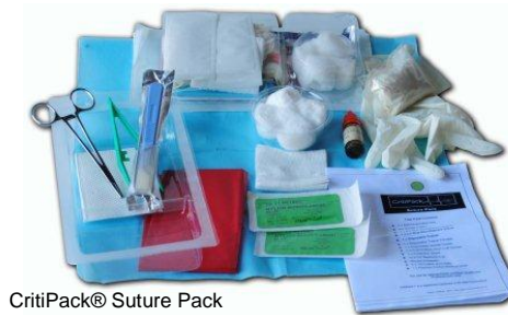
CritiPack® Suture Pack