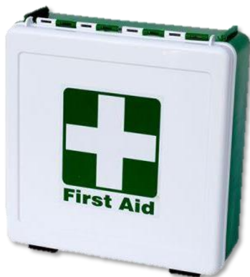
Regulation 3 FA Kit - Suitcase