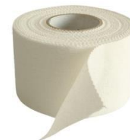
CritiCare® Rigid Sports Strapping