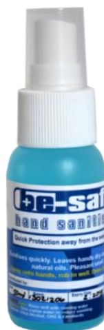
BS PM Hand Sanitiser