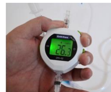
Cuff Manometer - Digital