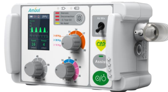
Ventilator - Transport - 6000s