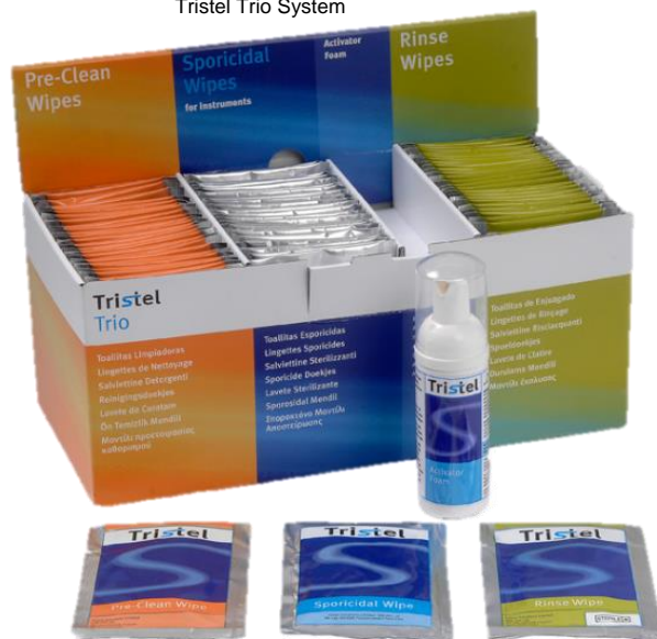
Tristel Trio System