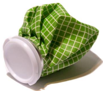
Cotton Ice Bag – Reusable 22.5cm