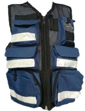
CritiCare® MVA Utility Jacket