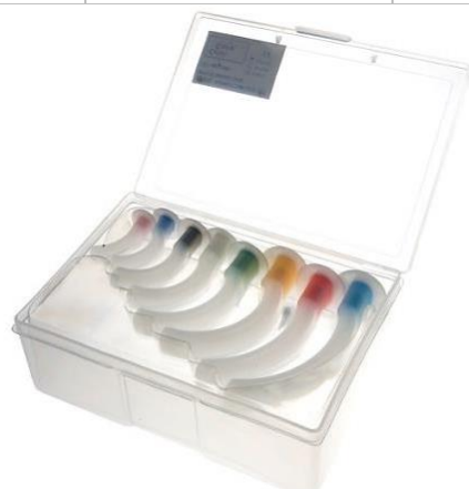
CritiCare® Airway Box Set