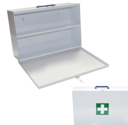
First Aid Box - Metal Medium