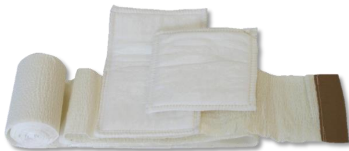
CritiBand MkII Trauma Bandage