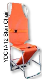
YDC1A12 Stair Chair