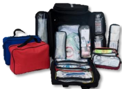
Advanced Life Support Kit