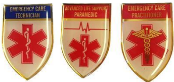
CritiCare® EMS Qualification Badges