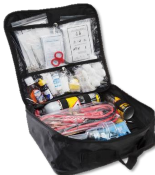
Emergency Motorist FA Kit