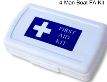
4-Man Boat FA Kit