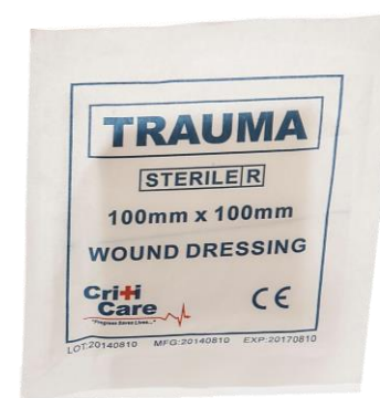
CritiCare® Trauma Dressings