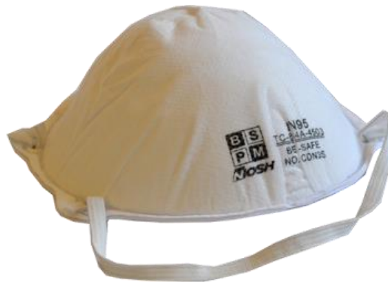
BSPM N95 Masks