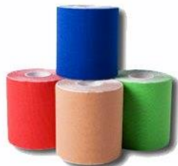
CritiCare® Kinesio Tape