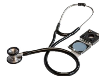
CritiCare® Cardiology Stethoscope