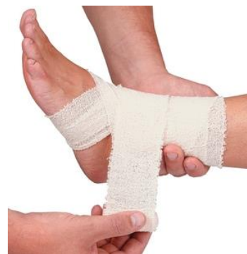
CritiCare® Crepe Bandages