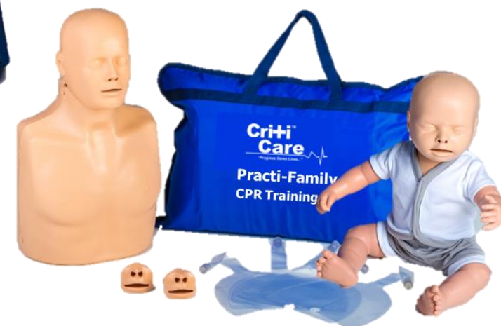
Practi-Family Infant CPR manikin Set