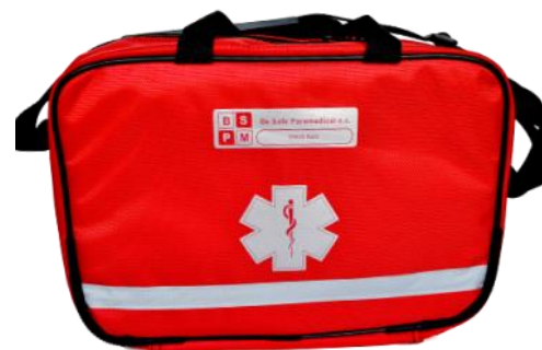
CritiCare® ALS Drug Bag