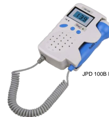
JPD 100B Foetal Doppler