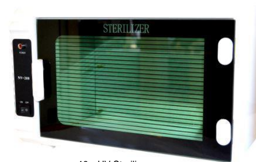
10w UV Steriliser