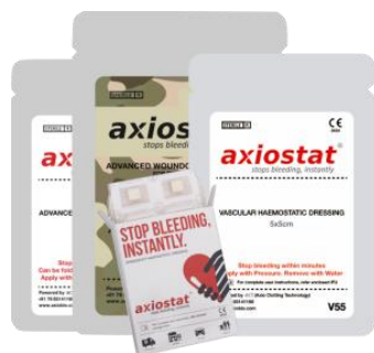
Axiostat Haemostatic Dressings