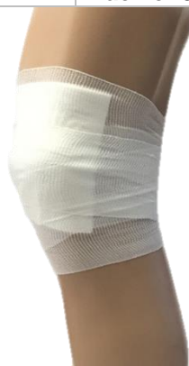
CritiCare® First Aid Dressings