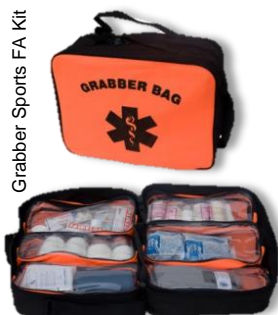
Grabber Sports FA Kit