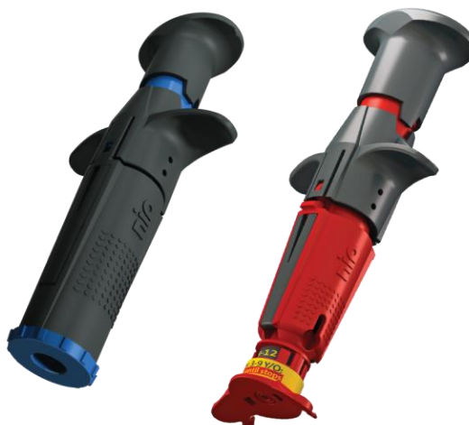
NIO® Intraosseous Devices