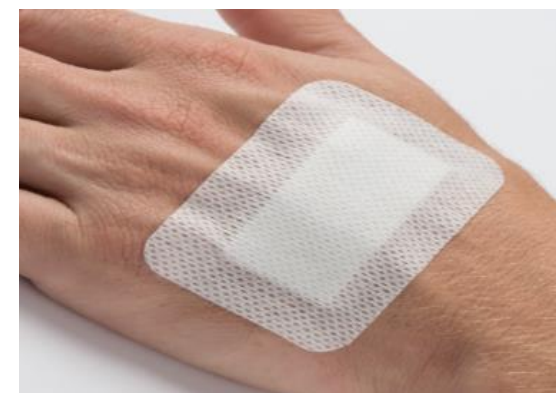
CritiCare® Island Dressings