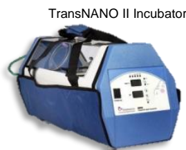
TransNANO II Incubator