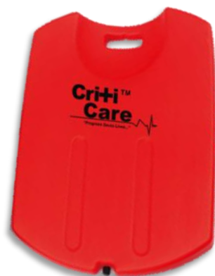
CritiCare® CPR Compression Board