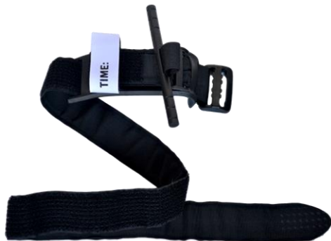
Rotation Compression Tourniquet