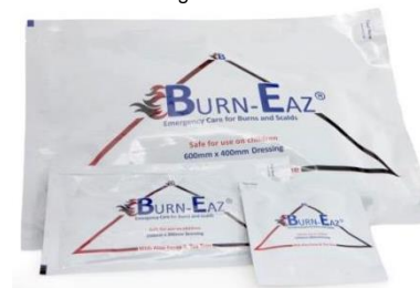
Burn-Eaz® Burn Dressings