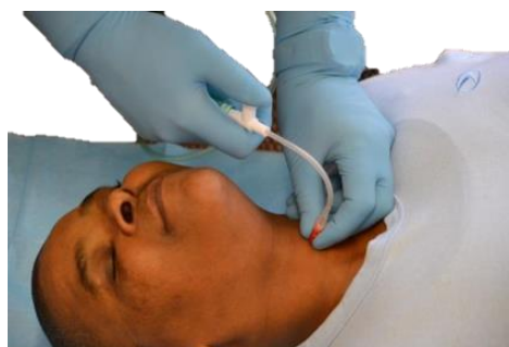
CritiPack® Needle Cricothyroidotomy Pack