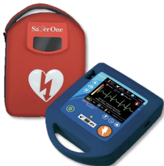
Saver One® Professional AED