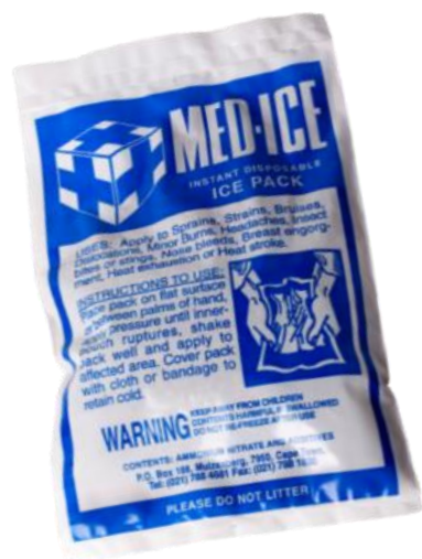
Med-Ice Instant Ice Pack