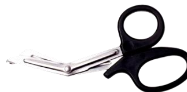
Scissors - Universal 19cm