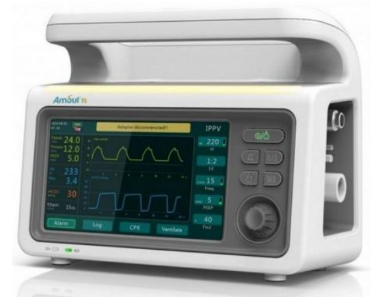
Ventilator - Transport – T5