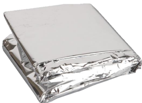
CritiCare® Rescue Blankets