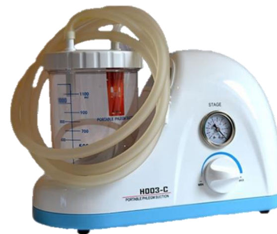
H003 Portable Suction Unit