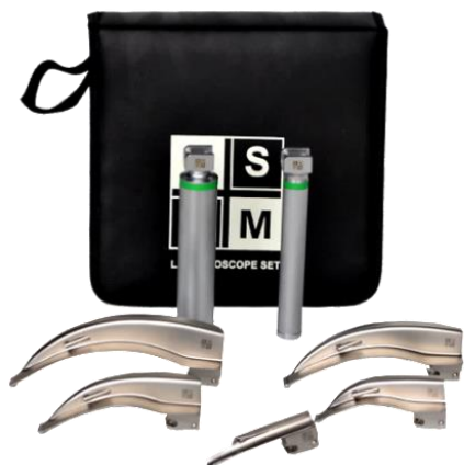
CritiCare® 5-Blade FO Laryngoscope Set