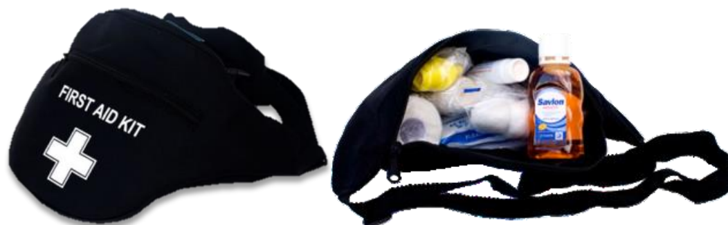
Moonbag Sports FA Kit