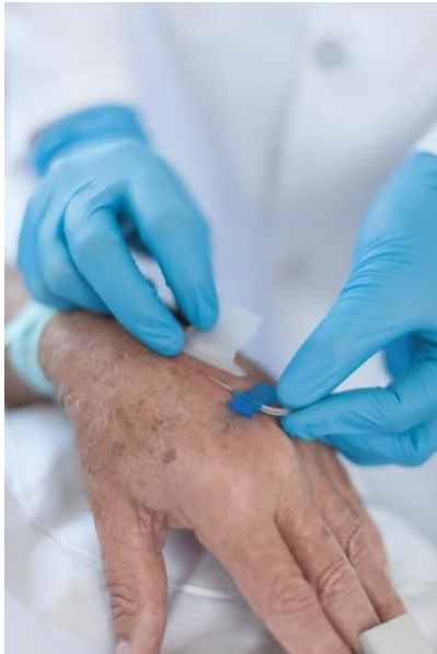
CritiCare® Nitrile Gloves