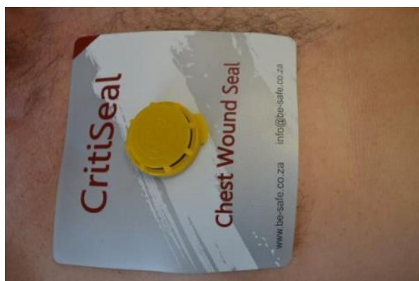
CritiSeal Chest Wound Seal