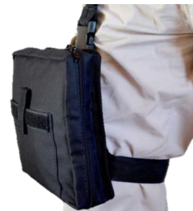
CritiCare® Leg Rig IFAK Bag