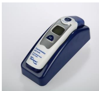
FR100 Dual mode Thermometer