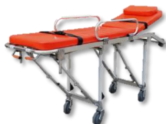
YSC-11 Ambulance Stretcher