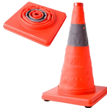
CritiCare® Road Cones