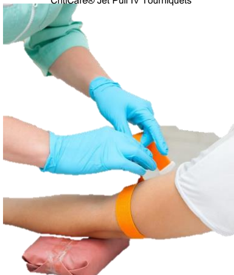
CritiCare® Jet Pull IV Tourniquets

"Uncontrolled bleeding causes 50% of battlefield deaths"