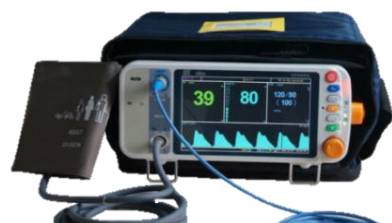
VS2000 Vital Signs Monitor