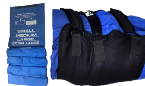
CritiCare® Pelvigrip Pelvic Binder