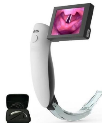
AVL-100 Video Laryngoscope