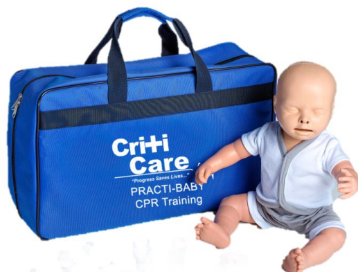
Practi-Baby Infant CPR Manikin