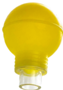
CertiCare® Oesophageal Detection Device