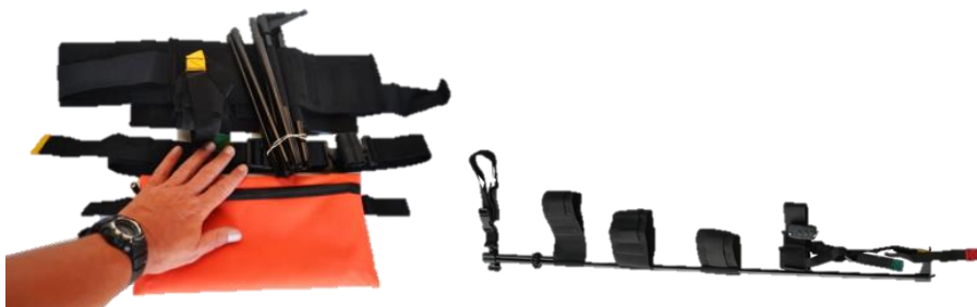
Compact Portable Traction Splint