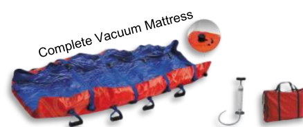
Complete Vacuum Mattress