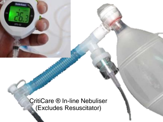
CritiCare® In-line Nebuliser (Excludes Resuscitator)