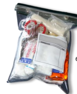
6-Man Boat FA Kit Vinyl