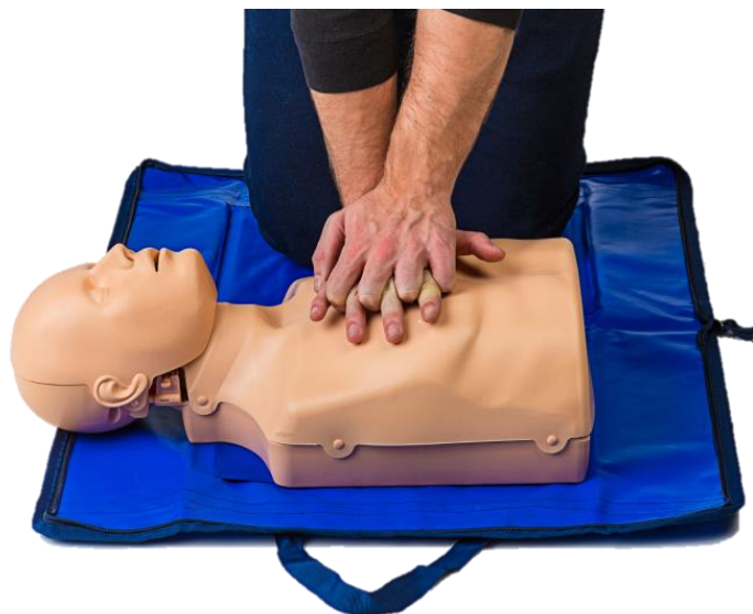
Practi-Man Advanced CPR Torso