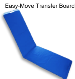
Easy-Move Transfer Board