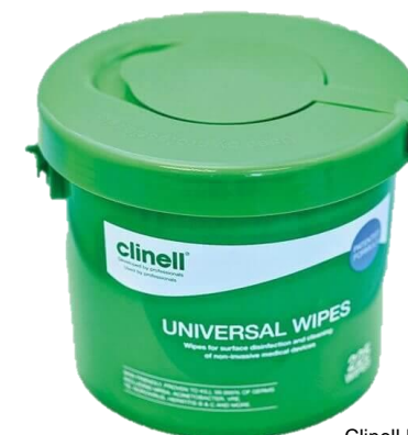
Clinell Universal Wipes