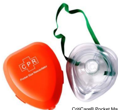
CritiCare® Pocket Mask