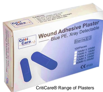
CritiCare® Range of Plasters