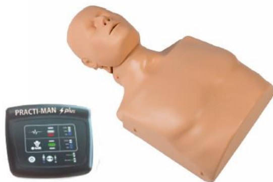
Practi-Man Advanced Plus Torso and Compression Feedback Monitor