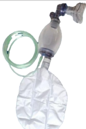
CritiCare® Bag-valve Mask Resuscitators