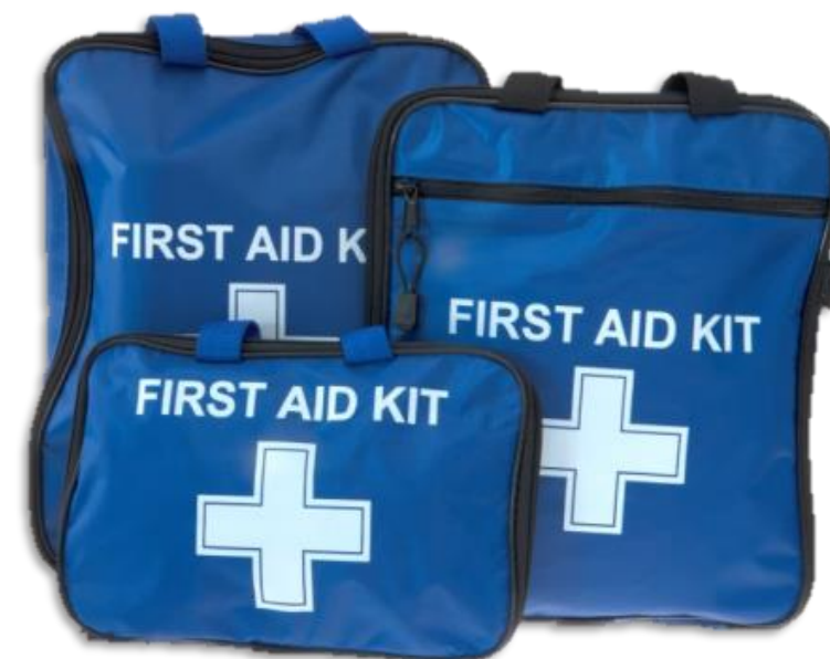
CritiCare® First Aid Kit Range